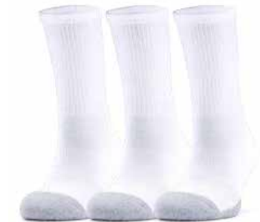
100 White // White // Steel