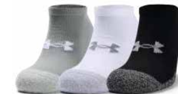
035 Steel // White // White