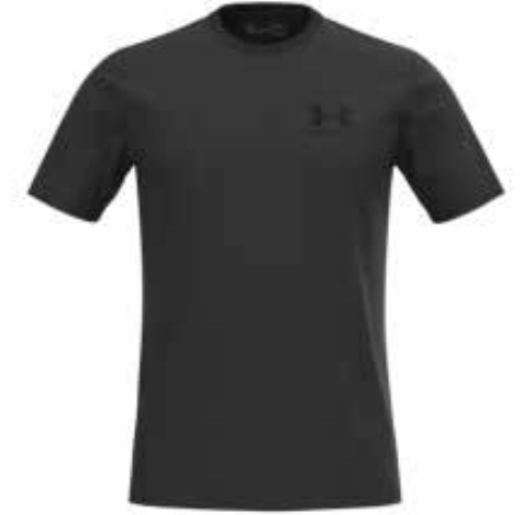
019 Charcoal Medium Heather // Black