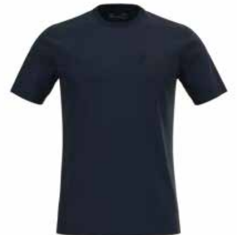
408 Academy // Black