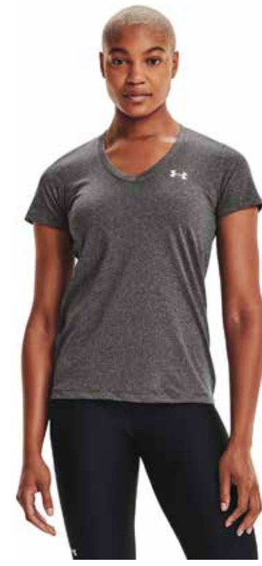
090 Carbon Heather // Metallic Silver