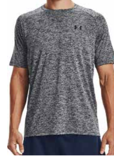
002 Black // Black