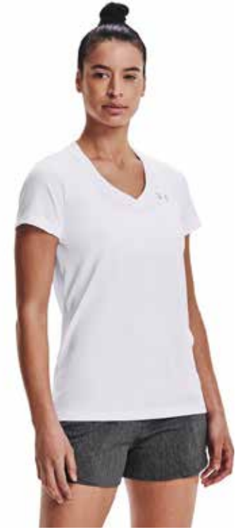
100 White // Metallic Silver