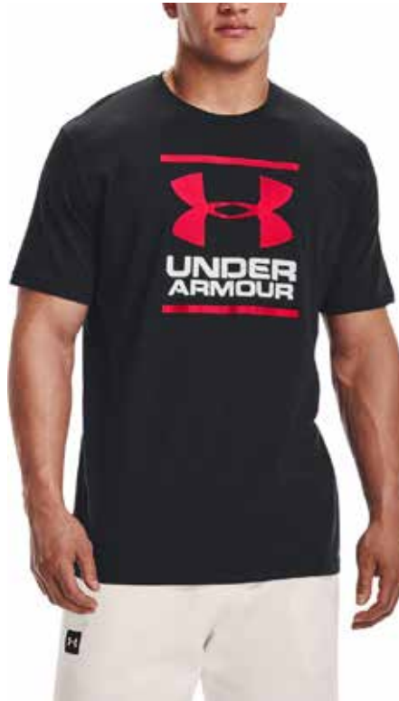
001 Black // White // Red