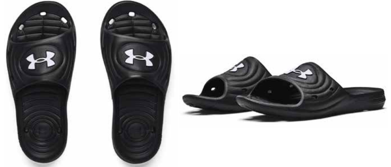
001 Black // Black // White