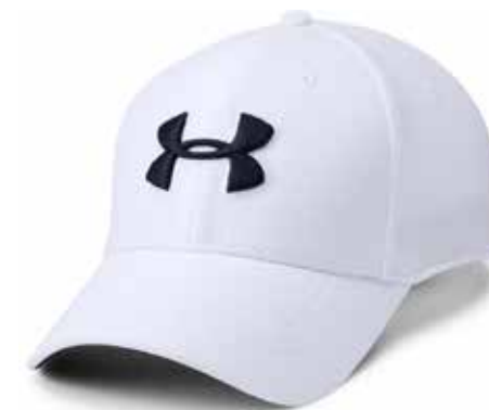
100 White // Steel // Black