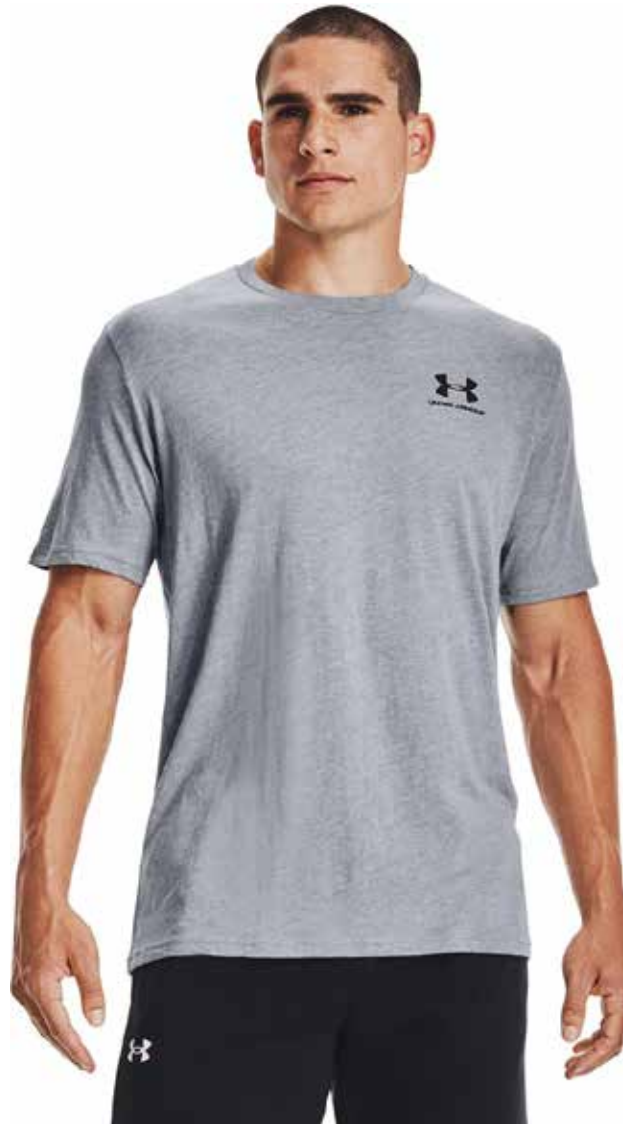
036 Steel Light Heather // Black