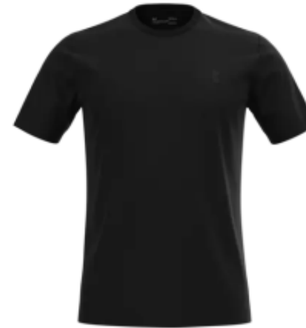
001 Black // Black