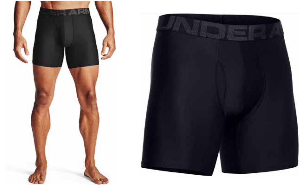
001 Black // Black