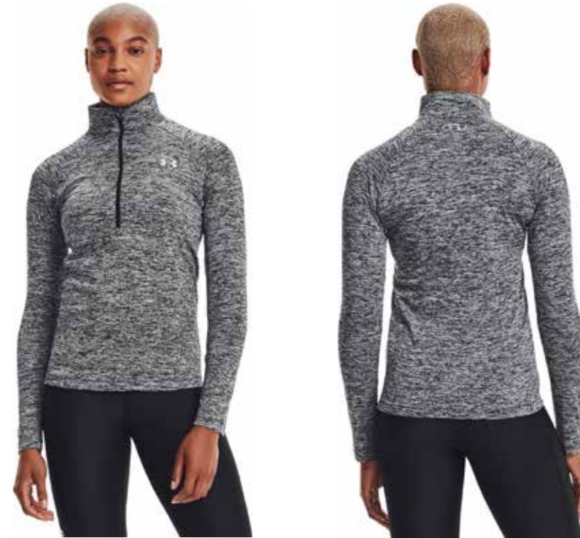
001 Black // Black // Metallic Silver