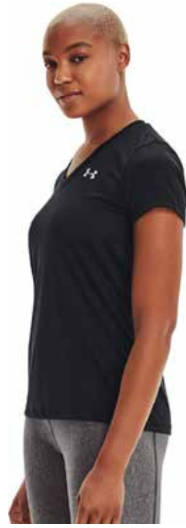
001 Black // Metallic Silver