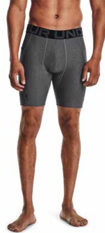
090 Carbon Heather // Black