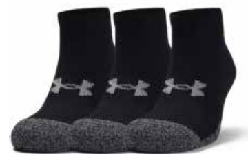
001 Black // Black // Steel