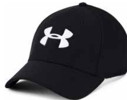
001 Black // Black // White