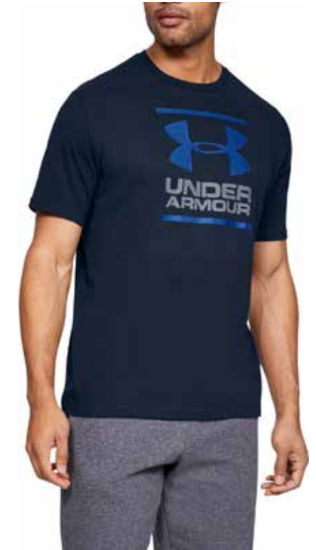
408 Academy // Steel // Royal