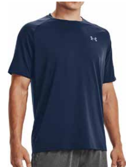
408 Academy // Graphite