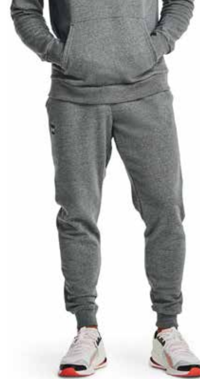
012 Pitch Gray Light Heather // Onyx White