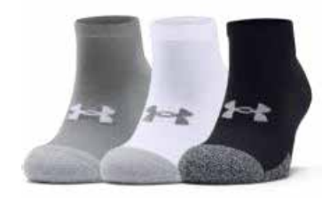
035 Steel // White // White