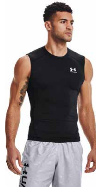
001 Black // White