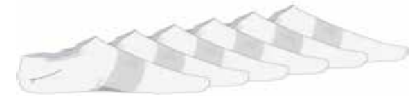
100 White // White // Halo Gray