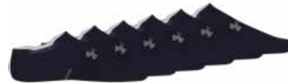
001 Black // Black // Pitch Gray