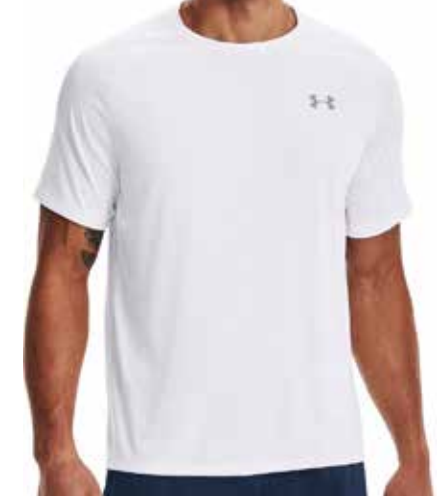
100 White // Overcast Gray