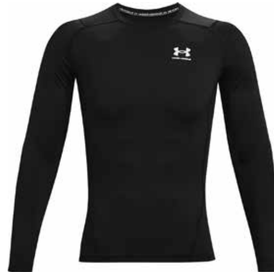
001 Black // White