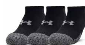
001 Black // Black // Steel