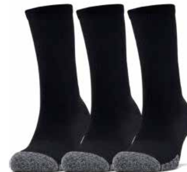
001 Black // Black // Steel