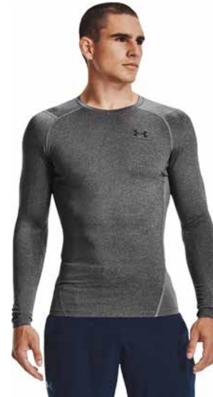
090 Carbon Heather // Black