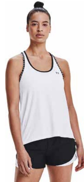
100 White // White // Black