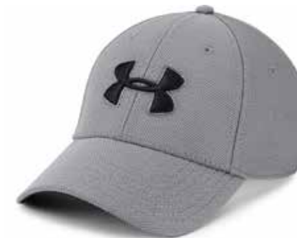
040 Graphite // Black // Black