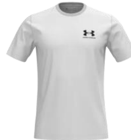
100 White // Black