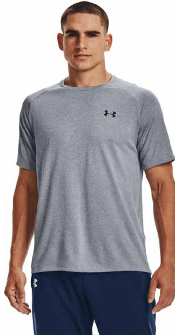
036 Steel Light Heather // Black