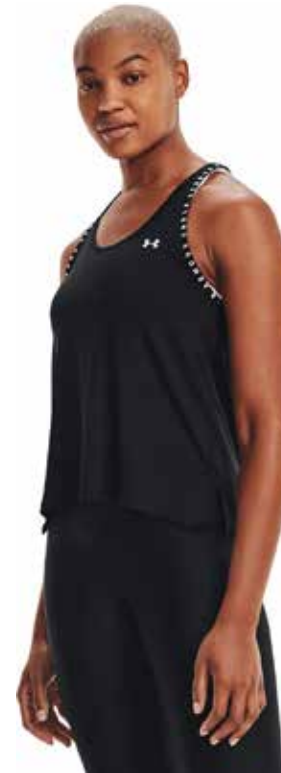
001 Black // Black // White