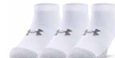
100 White // White // Steel