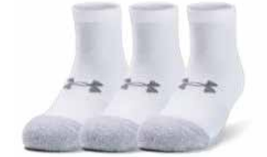
100 White // White // Steel