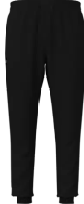
001 Black // Onyx White