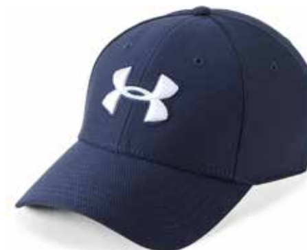
410 Midnight Navy // Graphite // White