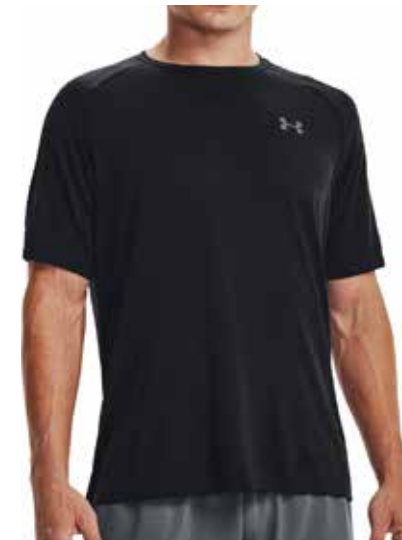
001 Black // Graphite