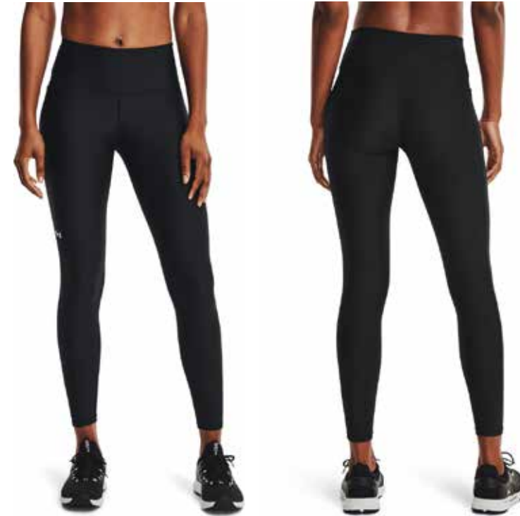
001 Black // White