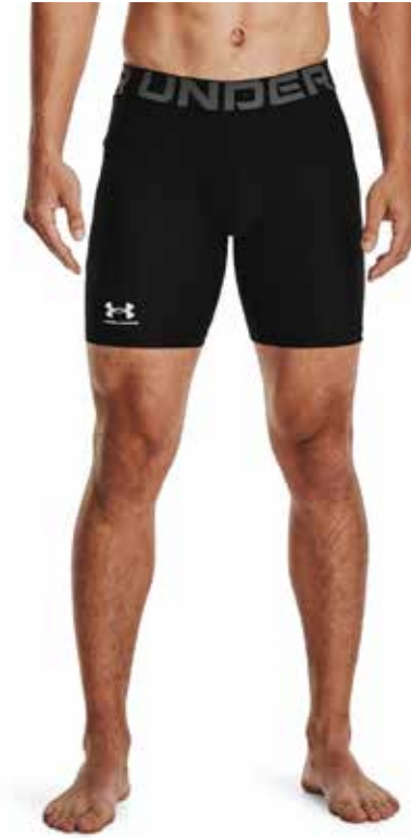
001 Black // White