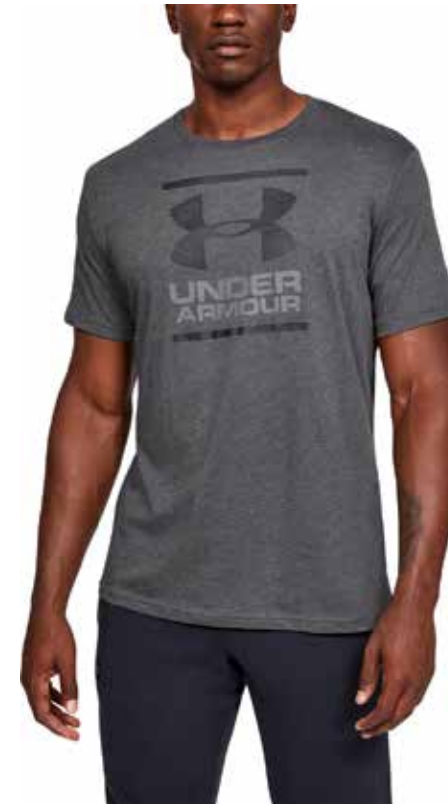
019 Charcoal Medium Heather // Graphite // Black