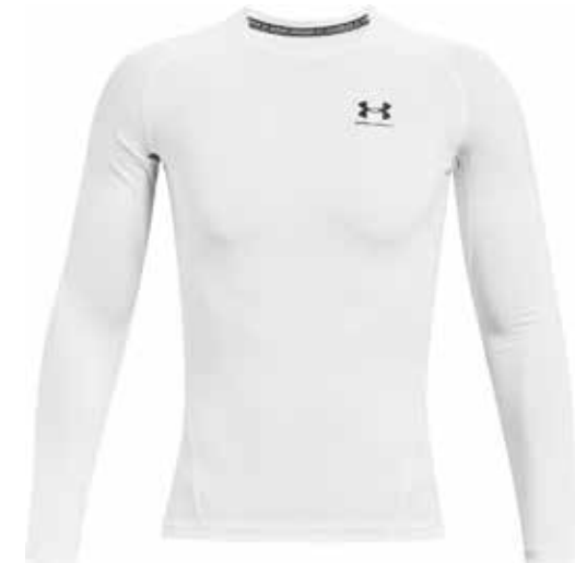
100 White // Black