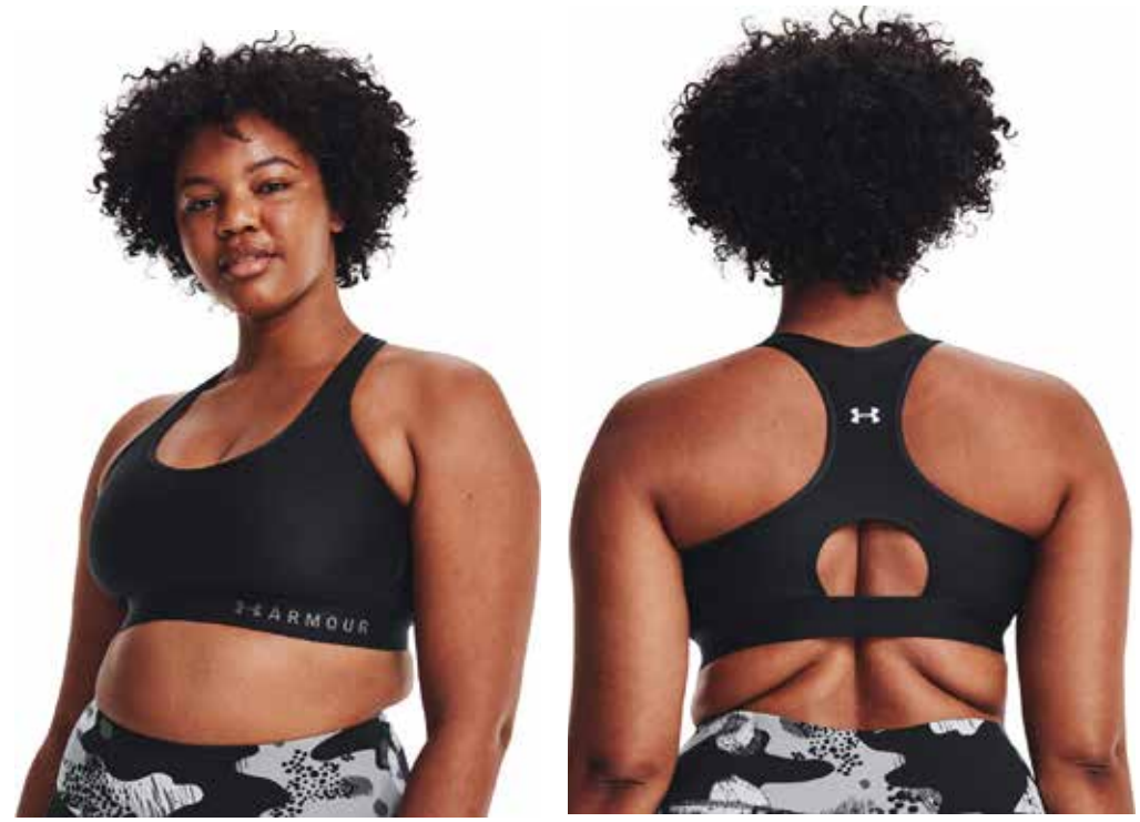
001 Black // Black // Metallic Silver