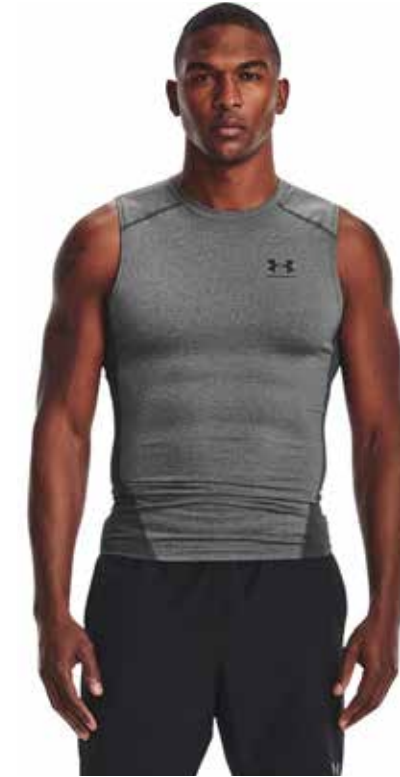
090 Carbon Heather // Black